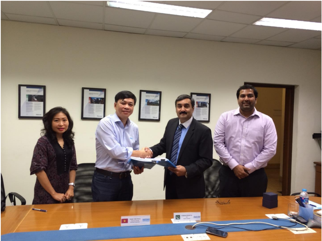
Signing the Joint Venture Agreement